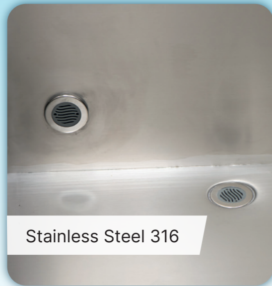
Stainless Steel 316