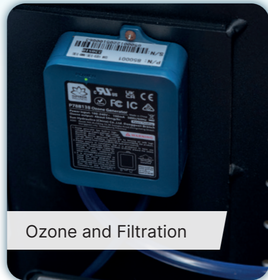
Ozone and Filtration